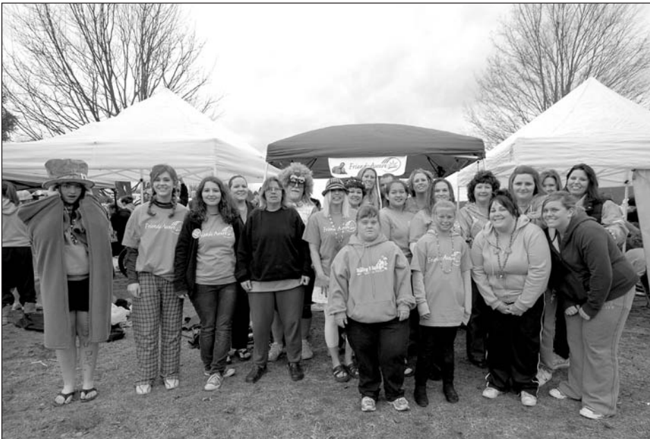
The 2011 Friends Aware Hooley Plunge Team.