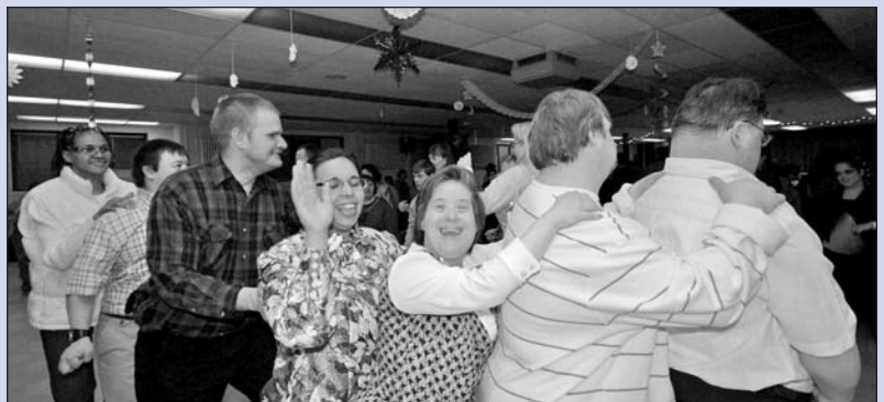
Friends Dancing at the Annual Spring Fling.

The Social Committee holds four events annually for individuals receiving services from Friends Aware, Inc. The Spring Fling is an annual event that is enjoyed by all who attend. Special thanks to the Social Committee and their many sponsors who help to make this and other events possible.