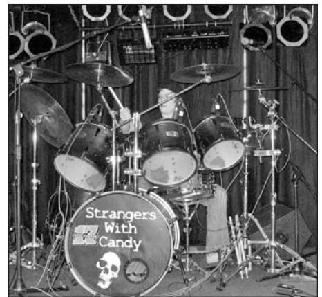
Sixteen local bands donated their time and talents to make the event a success!