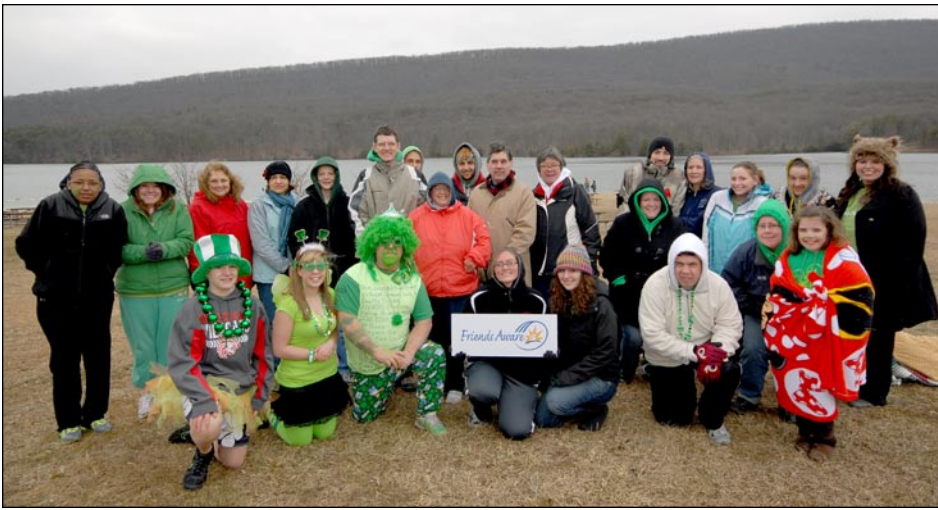
The 2013 Friends Aware Hooley Plunge Team