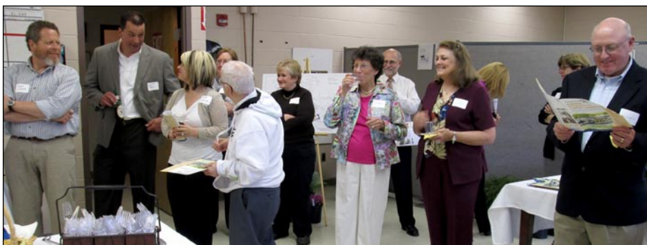
Guests were entertained with tours of the facility, door prizes, and elegant refreshments.

Nearly 60 years ago, Friends Aware was born as a grass roots organization, with a handful of families who wanted more opportunities and a greater quality of life for their family members. Today, Friends Aware serves over 140 adults with developmental disabilities in Allegany County, and employs more than 240 full- and part-time staff members.