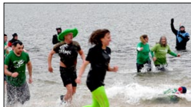
Special Thanks go to our FAI Team Shirt Sponsors, Wells Fargo Advisors.