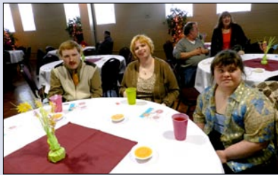
Good Times with Good Friends!

The Friends Aware Social Committee held their annual Spring Fling dinner and dance on March 21st at Windsor Castle. A great time was had by all!