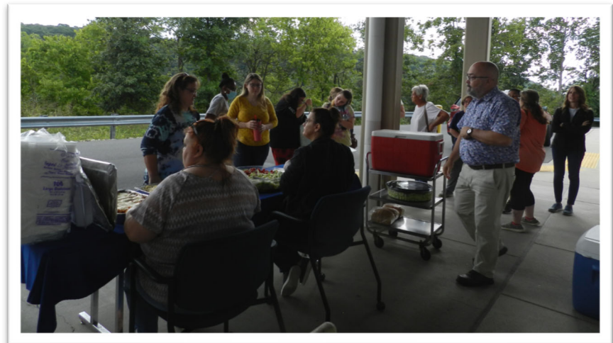
On Friday of DSP WEEK 2022 Admin served food from Oscar's to Direct Support Staff

It's important to note that our mission at Friends Aware is to provide people with diverse abilities the opportunities and support to live their best lives as valued members of the community. This effort would not be possible without the hard work of our Direct Support Staff. This upcoming September, Friends Aware is celebrating Direct Support Professionals week on the 11 th through the 15 th . Throughout that week FAI will be celebrating our DSP staff every day.